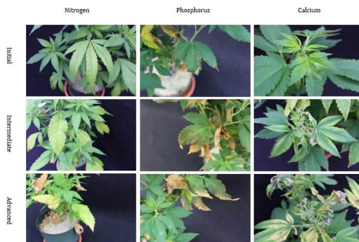
Figure 2. Nutritional disorders of nitrogen (N), phosphorus (P), and calcium (Ca) deficiency in Cannabis sativa 'T1' plants. These pictures display the symptomological progression of nutritional disorders from initial, intermediate, through advanced.

Symptoms of nitrogen (N) deficiency developed 6 weeks after treatment. The plants first displayed slight stunting when compared to the control. Initially, the plants developed a slight overall yellowing or paling of the lower foliage (Figure 2). As the deficiency progressed, the yellowing became more intense and progressed up from the bottom-most leaves to the middle foliage. In advanced symptoms, the yellowing leaves became completely yellow and eventually turned necrotic and abscised.