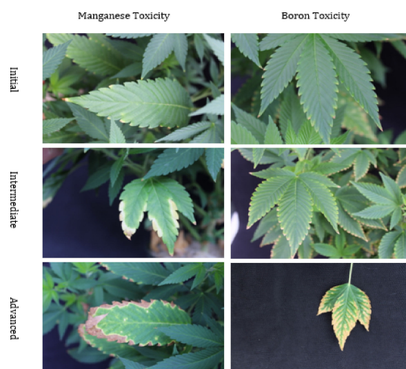
Figure 5. Nutritional disorders of manganese toxicity (Mn) and boron toxicity (B) in Cannabis sativa ‘T1’ plants. These pictures display the symptomological progression of nutritional disorders as they progress from initial, intermediate, and advanced.

Symptoms of Mn toxicity developed 7 weeks after treatment. Initially, the plants developed a marginal yellowing of the lower leaves (Figure 5). This yellowing intensified and moved inward on the leaf surface toward the midrib. In advanced symptoms, the leaf margin became necrotic, and the leaf appeared severely chlorotic. In some cases, the symptomatic leaves abscised (Figure 5).