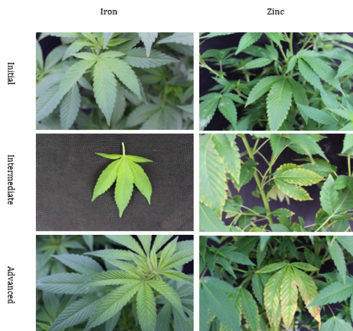
Figure 6. Nutritional disorders of iron (Fe) and zinc (Zn) deficiencies in Cannabis sativa ‘T1’ plants. These pictures display the symptomological progression of nutritional disorders as they progress from initial, intermediate, and advanced.

Symptoms of upper leaf interveinal chlorosis developed on Fe-deficient plants after 9 weeks of iron deficiency treatments. The leaves were lighter in appearance compared to control plants, and symptoms spread throughout the upper half of the foliage, especially around the growing tip and newly expanding leaves (Figure 6). Symptoms of Fe stress began as a slight marginal yellowing of the leaflets, especially around the base of the leaf (Figure 6). As symptomology progressed, the upper foliage displayed interveinal chlorosis on the new and expanding leaves, while the lower and mid foliage displayed a healthy dark green coloration (Figure 6).