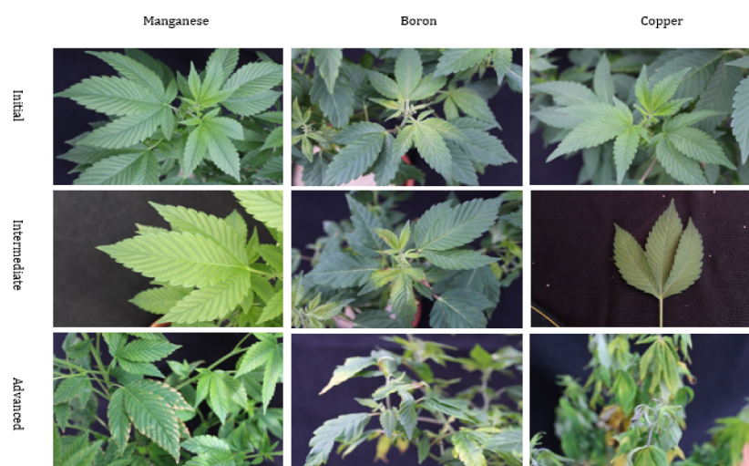
Figure 4. Nutritional disorders of manganese (Mn), boron (B), and copper (Cu) deficiency in Cannabis sativa 'T1' plants. These pictures display the symptomological progression of nutritional disorders as they progress from initial, intermediate, and advanced.

Symptoms of Mn deficiency developed 6 weeks after treatment. Initially, the plants developed a bright yellow netted interveinal chlorosis on the upper and central foliage (Figure 4). This chlorotic netting initiated at the midrib of the leaflets and spread outward toward the leaf margin as symptoms progressed. In advanced symptoms, the interveinal netting became very distinct against the green veinal regions. Additionally, the interveinal regions developed small tan necrotic regions on the leaf surface (Figure 4).